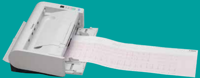
Long Paper Scanning